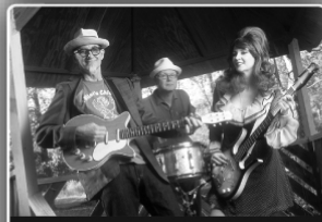
Southern Culture on the Skids