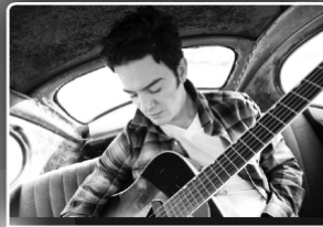
G Love & Special Sauce